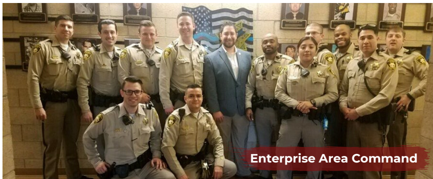
Enterprise Area Command