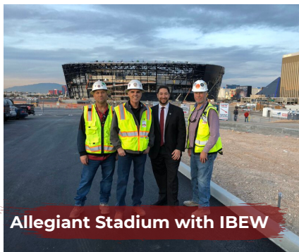
Allegiant Stadium with IBEW