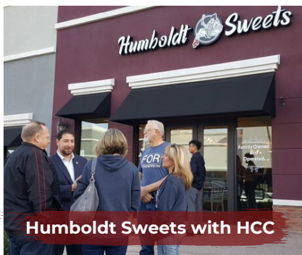
Humboldt Sweets with HCC